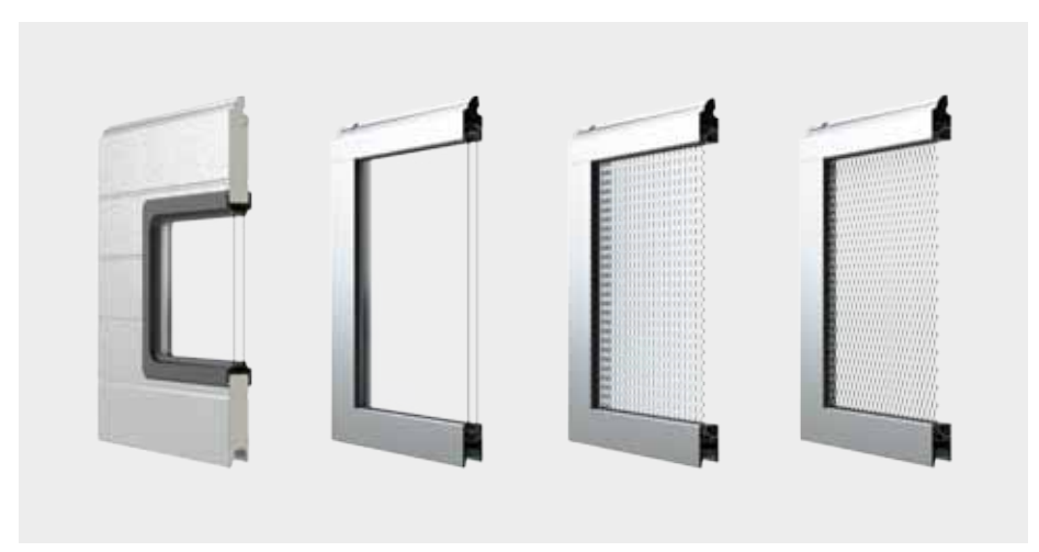
SPECIAL SECTIONS (from the left):

Steel door panels with windows or glazed aluminium sections are an interesting solution. They are filled with single or double window made of plexiglass resistant to scratching. Industrial doors made of glazed sections may serve as shop windows or they may discretely divide the space in the room if they are filled with matt, smoky or milk glass.