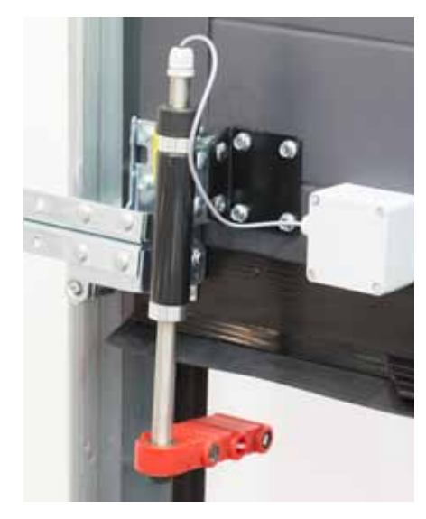
PHOTOCELL The photocell before the door additionally increases the level of safety.

The chain of authorized KRISPOL Partners guarantees a quick help and professional installation and services. Providing the investment with products will guarantee the convenient servicing and feeling of safety. Your company is of a great value. The solutions applied in our doors will help to take care of its full safety. A professional advisor from the authorized KRISPOL sales point will help to find exactly what you need.