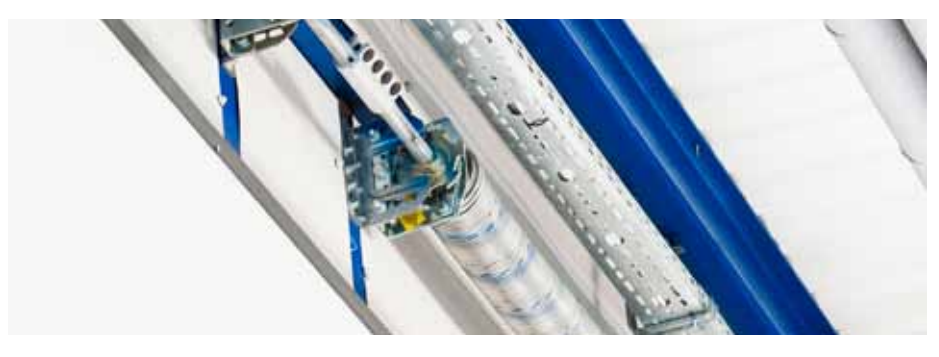
SAFETY MEASURES Each door is equipped with safety feature in case of line or spring breaking.