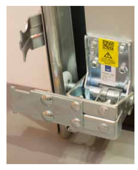
ANTI-LIFT DEIVCE The solution stopping the prying of the door from outside.