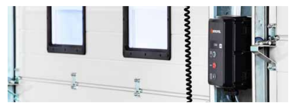
COMFORTABLE STEERING Different options of the door steering guarantee comfort for all users.