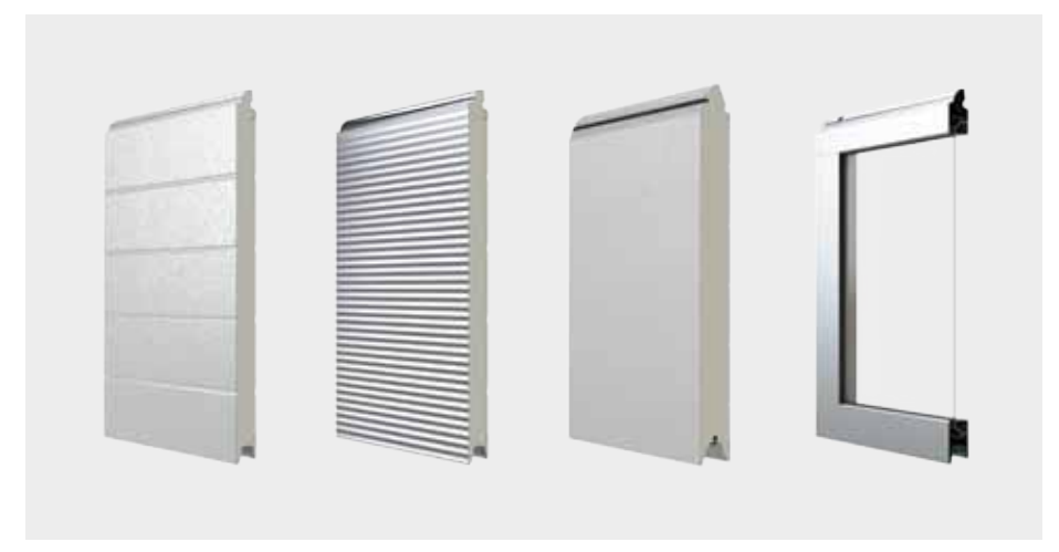
SECTIONAL DOORS PANELS (from the left): K2 IS/K2 IA panel, K2 IM panel, K2 IS 60 panel, K2 IP panel

Door sections are 40 mm thick and they are filled with polyurethane foam. The warmest door KRISPOL K2 IS 60 is recommended for the buildings requiring high thermal insulation. It is built of plain 60mm panels and it has the developed system of perimeter sealing – double sealing on the bottom panel and two-lip side sealing. Apart from steel type of doors, we also offer K2 IA and K2 IP aluminium doors. K2 IA doors with narrow embossing look identical as their steel counterpart K2 IS, but are lighter and have a higher class of resistance to corrosion. The fully glazed K2 IP doors are an interesting alternative for full doors. They are characterized by modern design, they expose the interior of the buildings and provide more daylight inside.