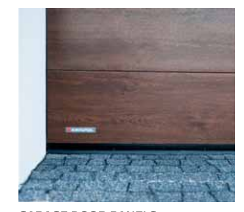
GARAGE DOOR PANELS Designs and colours of garage doors are available also for industrial doors.