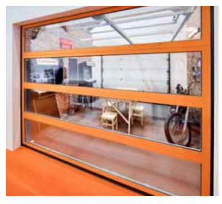
IP SECTION WITHOUT VERTICAL POLES The door serve as a shop window thanks to glazed sections.

IS/IA with windows, IP with double glass, IP with perforated sheet, IP with aluminium net